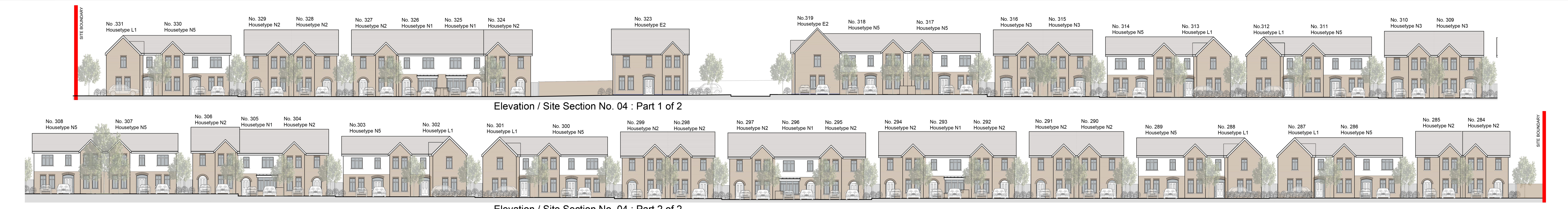
Elevation / Site Section No. 04 : Part 1 of 2