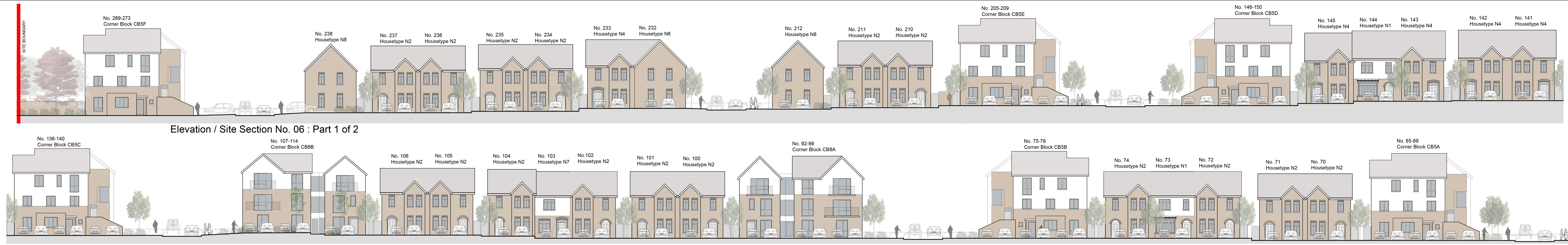
Elevation / Site Section No. 06 : Part 1 of 2