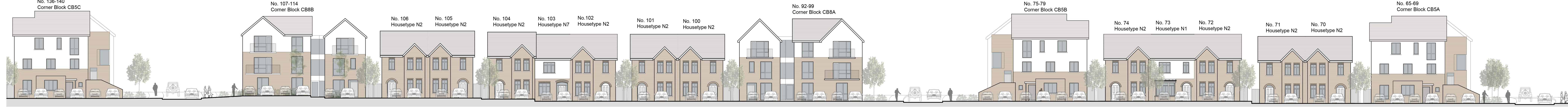
Elevation / Site Section No. 06 : Part 2 of 2